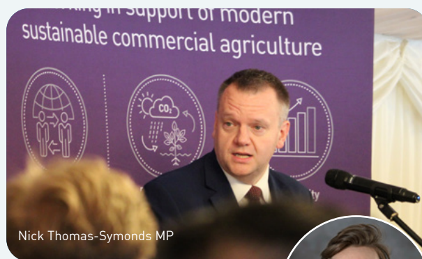
Nick Thomas-Symonds MP