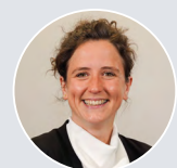
Mairi Gougeon Cabinet Secretary and Rural Affairs & Islands