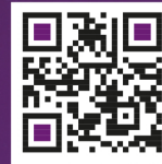
FEED & FOOD SAFETY ANIMATION

SCAN QR CODE TO WATCH ANIMATION VIDEOS >>