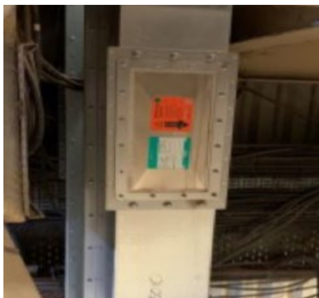
Figure 2 Typical explosion panel on belt & bucket elevator