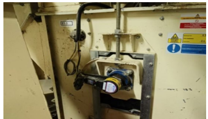
Figure 1 Elevator boot fitted with rotation sensor