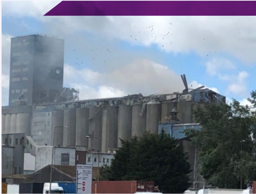
Tilbury Port Explosion