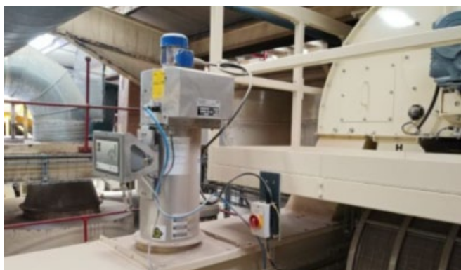
Figure 9 Example of compressed air cleaning dust filtration unit (Unit fitted with dust explosion relief)

In most existing systems it is not thought reasonably practicable to replace fans and motors with ATEX rated ones provided they are maintained and operated as designed. Fans and their motors are very unlikely to give rise to an explosion. This is because there must be three simultaneous failures; a combustible cloud within the air being transported, a failure in the filter mechanism and a fault in the fan giving rise to an ignition source. All are very low probability events and when combined can almost be considered so remote as to not require consideration. There is also fourth factor which is that dust collectors and fans are likely to be in a remote area which is not occupied other than occasionally. If existing equipment has to be replaced (worn out) then it should be replaced with suitably rated equipment (see section 10).