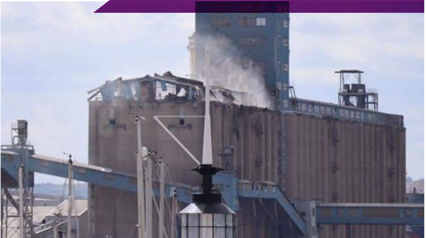
Tilbury Port Explosion Photo sourced from @AislínCL July 2020