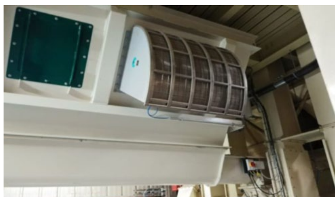
Figure 5 Grinder under hopper fitted with a flameless vent

Explosion relief should be incorporated in the under hopper and dust filter. If the dust filter and under hopper are together a single explosion relief panel may be used if of a suitable size. Similar to other explosion relief panels they should be ideally vented externally otherwise to a safe place. Flameless venting can be used to assist in this if fitted internally.