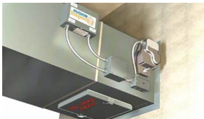
Figure 8 Fire damper system installed in cooler fan duct upstream of filtration system

The event of a fire within the cooler, in addition to shutting down the aspiration system, the discharge mechanism should also be stopped to prevent the potential spread of burning materials downstream. Likewise, the press feeder should also be disabled to prevent further material entering the cooler.