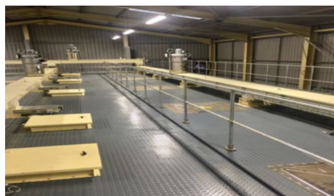
Figure 6 Example of bin top explosion relief panels – to right of barrier.

Raw material bins which have been zoned should incorporate explosion relief. Bins that have not been zoned because of the nature of the material they contain combined with the method of filling do not. For new bins the required vent area can be calculated. Historically HSE recommended a ventilation area of 1m 2 for every 6m 3 of volume where the bin capacity was up to 30m 3 . For plant with over 300m 3 capacity a vent area of 1 m 2 /25m 3 was recommended (HS (G) 103 first edition). Within the UK animal feed sector there has been virtually no reported examples of bin failure following an explosion within where there has been some form of explosion relief.